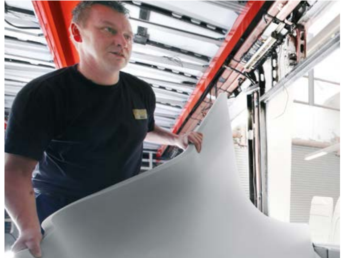
HANNO manufactures die-cut foam parts for noise protection and thermal insulation in vehicles

Then we particularly recommend these products: