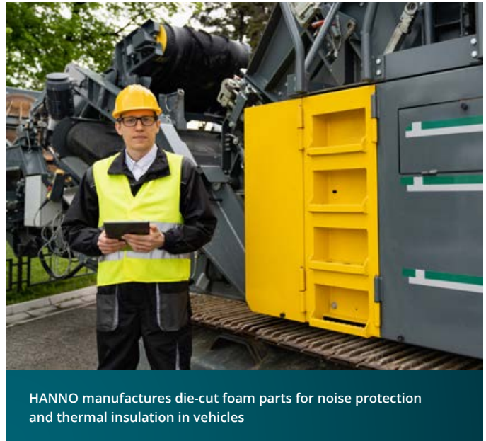
HANNO manufactures die-cut foam parts for noise protection and thermal insulation in vehicles

Then we particularly recommend these products: